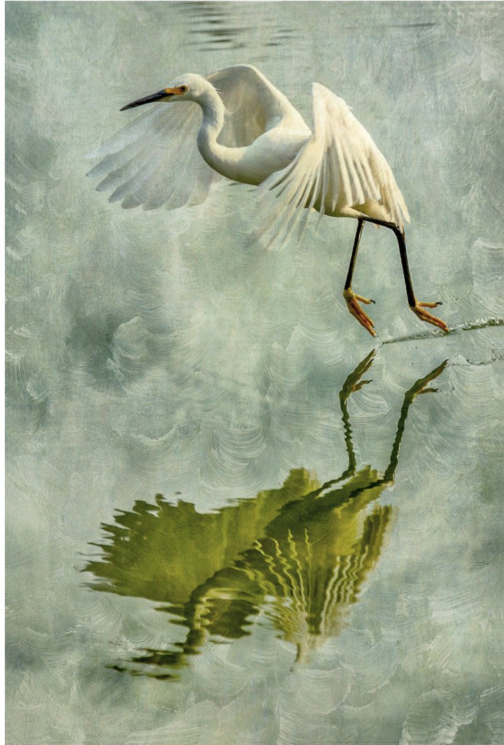
Egret, Reflected , 2012, pigment ink on vellum over white gold leaf

My work is rooted in the serenity I find in the sinuous elegance of organic forms. It's a celebration of the senses anchored in the visual — an exploration of my spiritual connection to our vulnerable natural world and the transcendence I find in its beauty. In those magical moments when my eyes and essence are engaged, I photograph what I feel, as much as see. The images are layered digitally with color and texture to manipulate the boundaries between the real and imagined, inspired by my background in painting, art history and collecting turn-of-the-twentieth century art and objects.