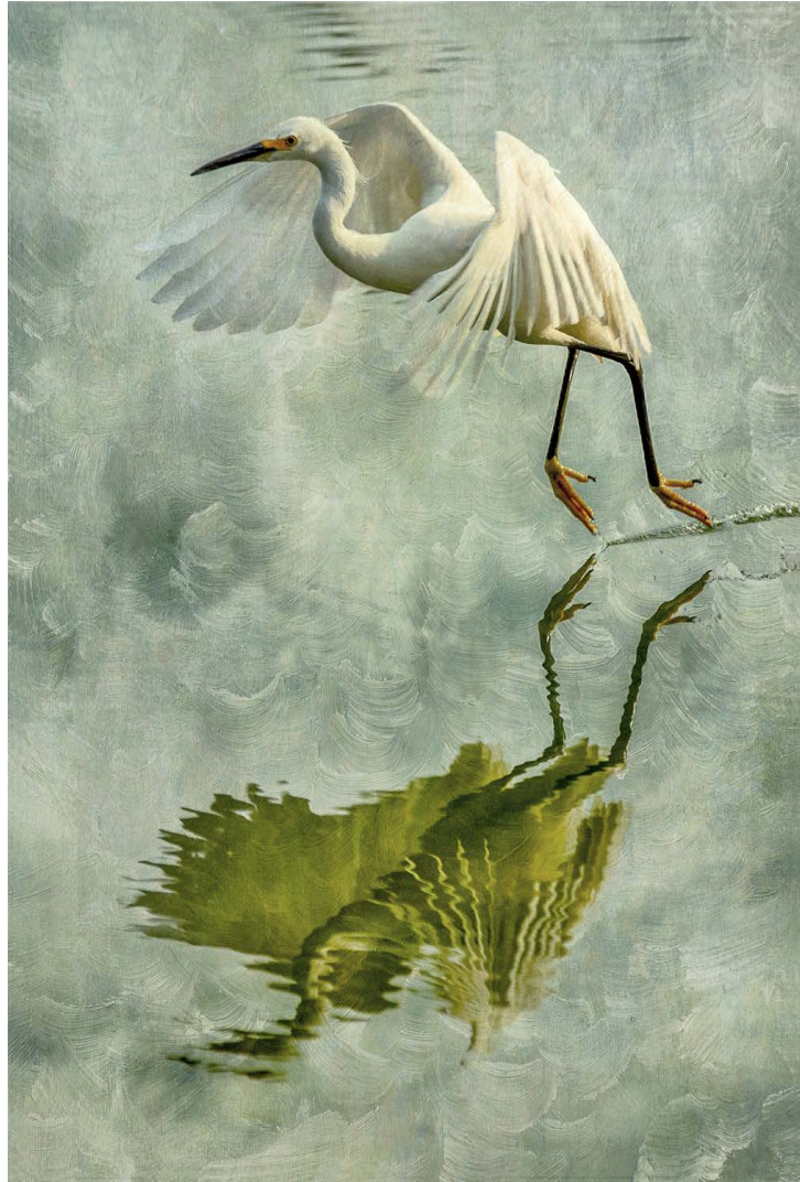
Egret, Reflected , 2012, pigment ink on vellum over white gold leaf

My work is rooted in the serenity I find in the sinuous elegance of organic forms. It's a celebration of the senses anchored in the visual – an exploration of my spiritual connection to our vulnerable natural world and the transcendence I find in its beauty. In those magical moments when my eyes and essence are engaged, I photograph what I feel, as much as see. The images are layered digitally with color and texture to manipulate the boundaries between the real and imagined, inspired by my background in painting, art history and collecting turn-of-the-twentieth century art and objects.