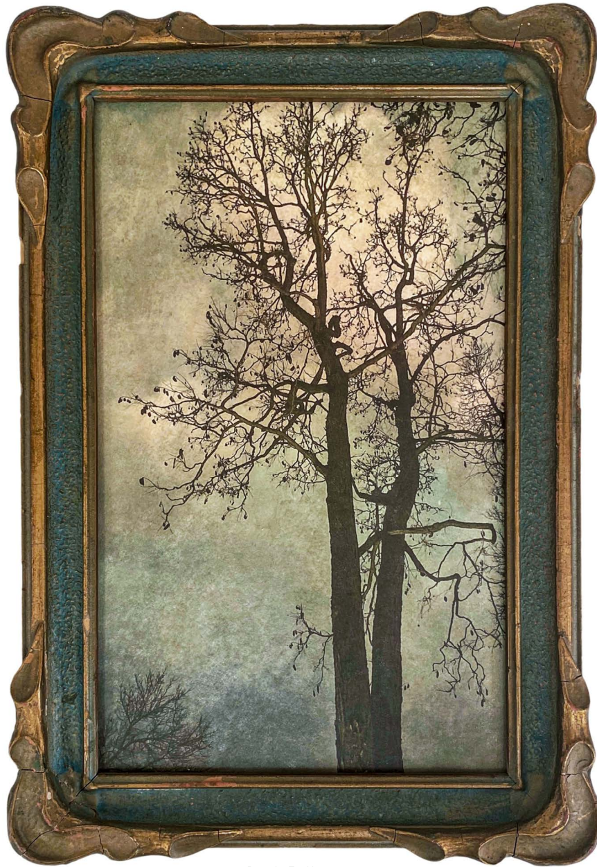
Dusk Falls, 2020 pigment ink on kozo over white gold leaf

The Patina Collection is an assemblage of gilded prints in the States of Grace series paired with antique frames — the synthesis of 40 years of collecting turn-of-the-twentieth-century art and objects and creating images inspired by the sinuous elegance of organic forms. The serpentine shapes are echoed in the subjects I photograph and the undulating curves of the Art Nouveau frames that house these works. I photograph intuitively — what I feel as much as what I see — and I strive to make the intangible tangible, preserving the visual poetry of these vanishing moments of beauty in our vulnerable environment. My images are layered digitally to manipulate the boundaries between the real and imagined, often altered within the edition to honor the variation. Printed on kozo, white gold, moon gold, 24k gold or palladium leaf is applied on the verso, infusing the artist's hand and suffusing the subjects with the spirituality of the precious metal. Each of these unique framed prints are a one-of-a-kind object of reverence.