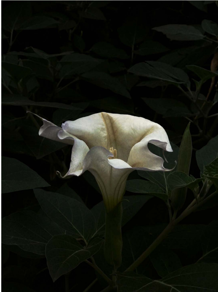
Datura , 2017, pigment ink on vellum over white gold leaf

MK: How do you see your work progressing into the future? Do you have anything new you are currently working on that we should be on the lookout for?