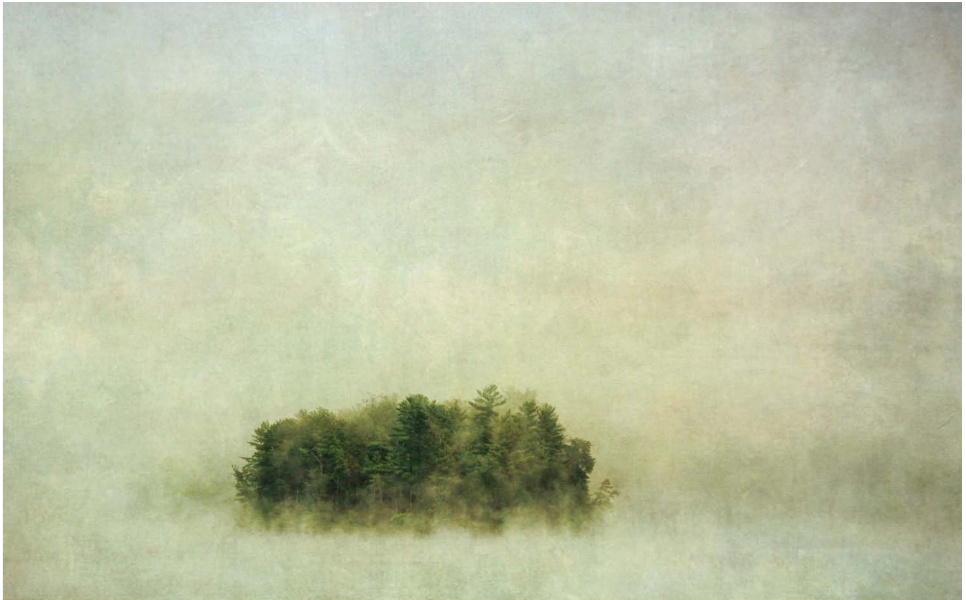
Island, 2018, pigment ink on vellum over white gold leaf

MK: You've lived in some wide ranging locations in the US over the years. Have these changes been work specific, and did you find the differences being reflected in the work you were creating at the time?