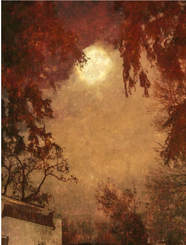
An Evening with the Moon, 2018 pigment ink on kozo over white gold leaf