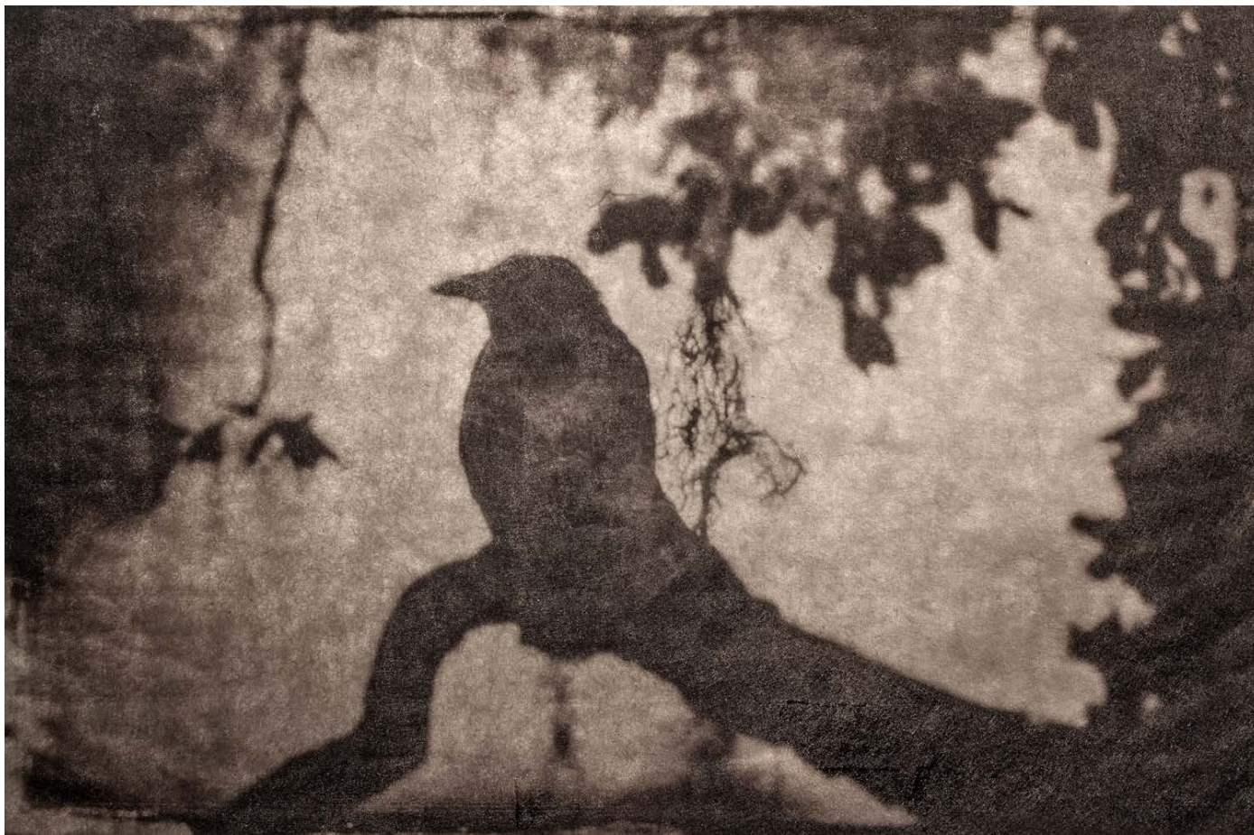
Thoughts of Silence, 2012, pigment ink on kozo over white gold leaf

WS: I suppose it started as a child seeking serenity under the undulating limbs of a weeping willow, a love affair with the elegant whiplash lines of art nouveau, the unexpected discovery of a book of photomicrography in college, and the soothing grace of the simple, sinuous lines of organic forms. I do feel a deep reverence and curiosity for the natural world. Many of us turn to nature for nurture. I think we have an innate desire or compulsion to commune with our surroundings and, at this time in particular, to appreciate what we have and bring awareness to what we are losing. The veneration of fleeting moments of beauty that began long ago is now intensified by the quickening pace of loss. Species are disappearing at 1,000 to 10,000 times the natural rate, with as many as 30 to 50 percent of all possibly heading toward extinction by mid-century. It's mind-boggling, frightening, and frustrating. My work is testament and tribute, adoration and obligation.