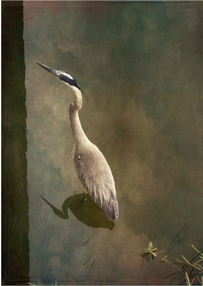
Young Great Blue Heron, 2017 pigment ink on vellum over white gold leaf

MK: You apply gold and silver leaf in the majority of your prints. Was there a process of discovery in using these materials in your prints? I would imagine a specific learning curve as well.