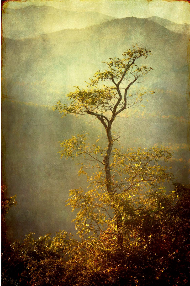
Locust, 2016, pigment ink on vellum over white gold leaf

My work is rooted in the serenity I find in the sinuous elegance of organic forms. I'm transformed in capturing the stillness of the suspended movement of light and compelled to preserve the visual poetry of these fleeting moments of vanishing beauty in our vulnerable environment.