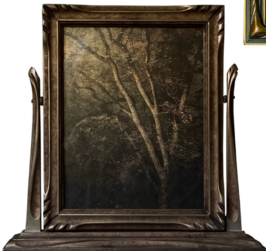
Top Left: Dusk Falls, 2019. Pigment ink on kozo over white gold leaf. Wendi Schneider © All rights reserved.