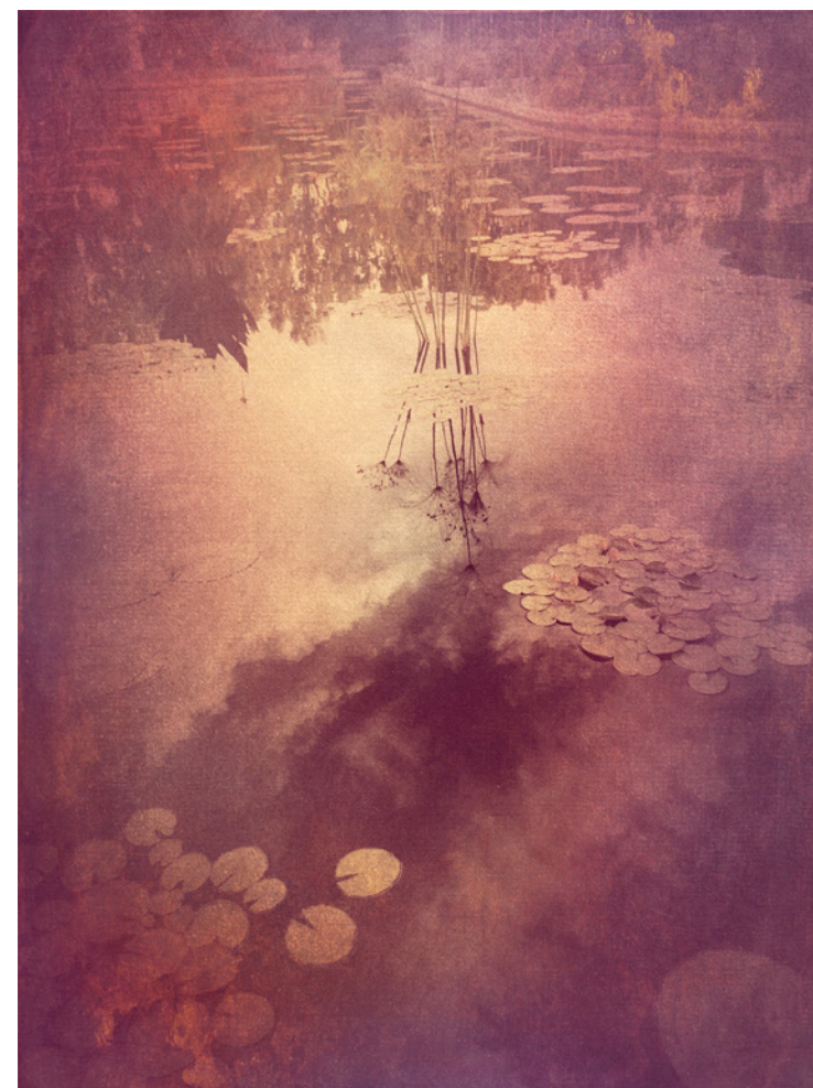
Left: Lily Pads, 2016. Pigment ink on vellum over white gold leaf. Wendi Schneider © All rights reserved.