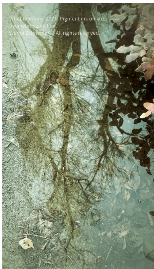
What Remains, 2021. Pigment ink on kozo over white gold leaf.

This process laid the groundwork for the unique layering and gilding that would become the foundation of 'States of Grace', which she began in 2012.