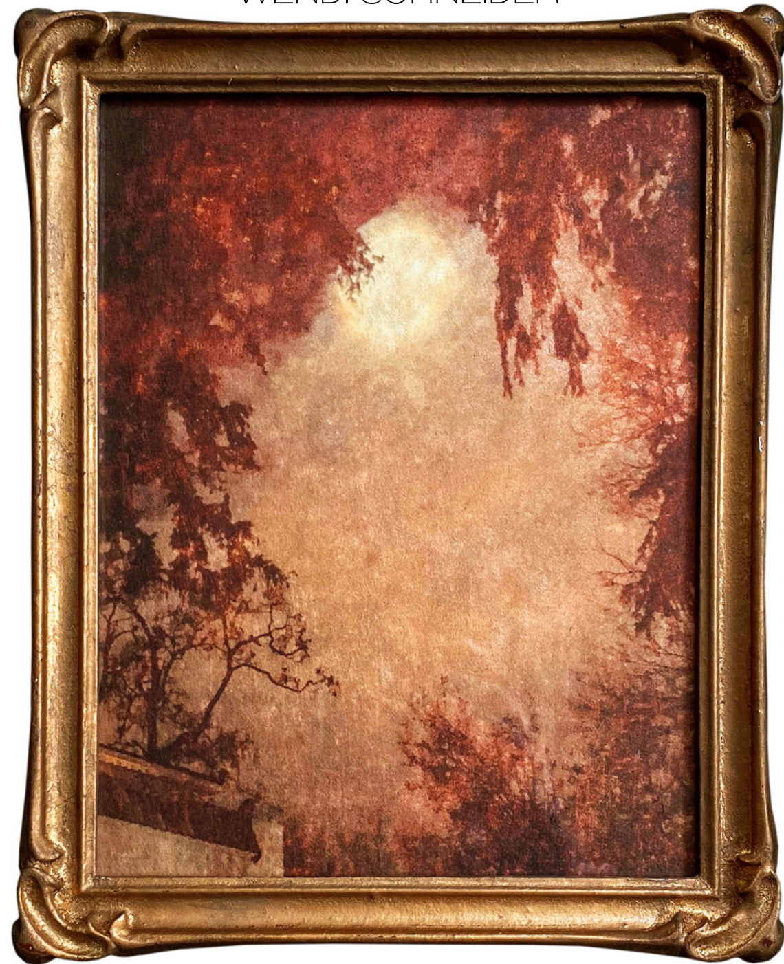
An Evening with the Moon, 2018 - pigment ink on kozo over white gold leaf. Wendi Schneider © All rights reserved.

'The Patina Collection is an assemblage of gilded prints in the 'States of Grace' series paired with antique frames – the synthesis of 40 years of collecting turn-of-the-twentieth-century art and objects and creating images inspired by the sinuous elegance of organic forms. The serpentine shapes are echoed in the subjects I photograph, and the curves of the Art Nouveau & Arts & Crafts frame house these works. Each of these unique framed prints is a one-of-a-kind object of reverence.