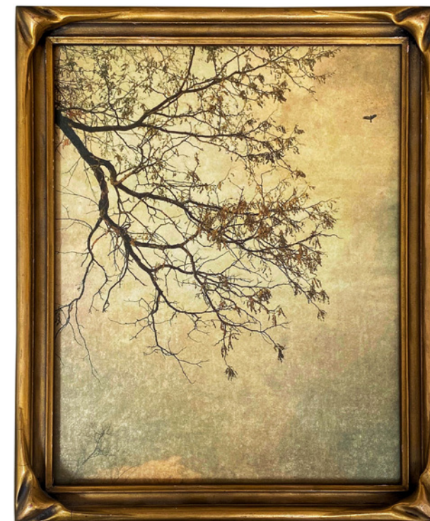
Little Black Angel, 2019. Pigment ink on kozo over white gold leaf. Wendi Schneider © All rights reserved.