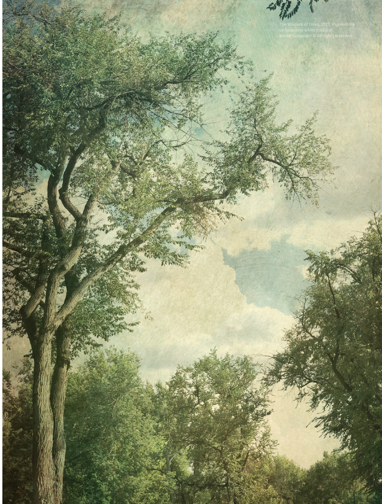
The Wisdom of Trees, 2019. Pigment ink on kozo over white gold leaf. Wendi Schneider © All rights reserved.