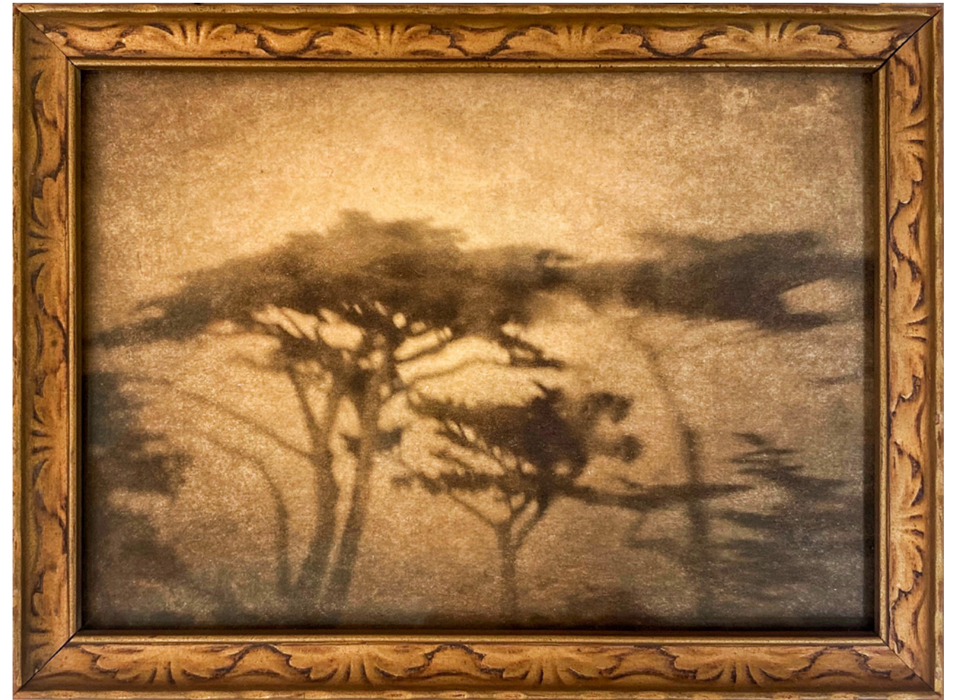
Top: Last Light, 2017. Pigment ink on kozo over white gold leaf.

'The Patina Collection is an assemblage of gilded prints in the 'States of Grace' series paired with antique frames – the synthesis of 40 years of collecting turn-of-the-twentieth-century art and objects and creating images inspired by the sinuous elegance of organic forms. The serpentine shapes are echoed in the subjects I photograph, and the curves of the Art Nouveau & Arts & Crafts frame house these works. Each of these unique framed prints is a one-of-a-kind object of reverence.