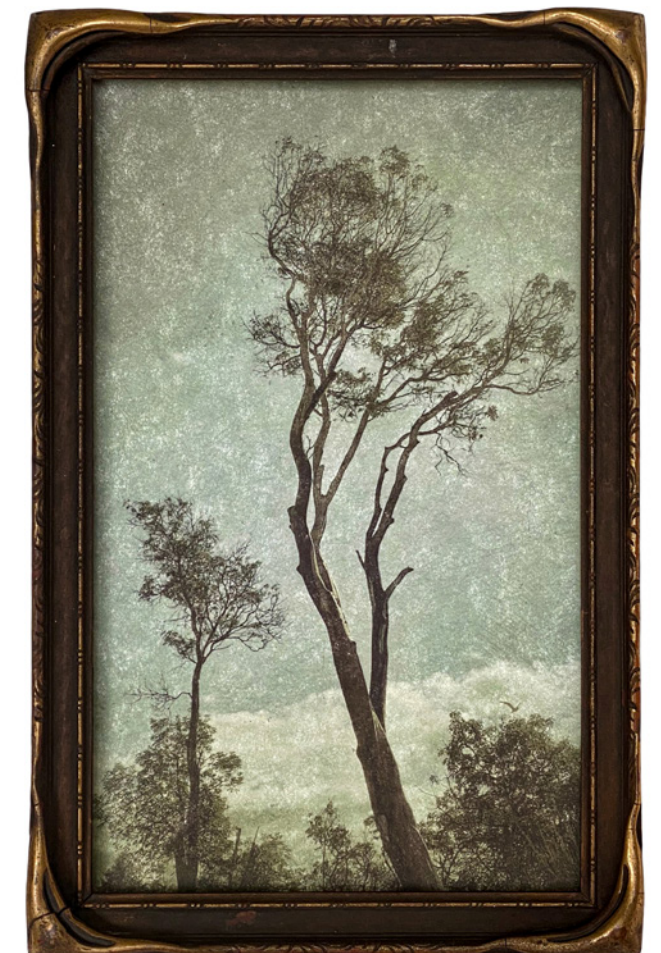
Right: Madrones, 2020. Pigment ink on kozo over white gold leaf. Wendi Schneider © All rights reserved.